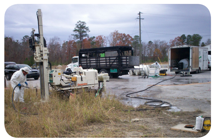
Injection of reducing agent into a hole drilled underground.

ISCR can treat some types of contaminants including DNAPLs that are difficult to clean up using other methods. It can destroy most of the contamination in situ without having to pump groundwater for treatment or dig up soil for transport to a landfill or treatment facility. This can save time and money. In addition, no energy is needed to operate a PRB because it relies on the natural flow of groundwater. ISCR is a relatively new method for cleaning up hazardous waste sites, but is seeing increased use at Superfund sites across the country.