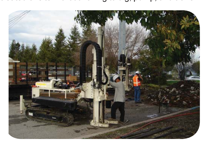
Injection of vegetable oil underground to improve conditions for bioremediation.

Bioremediation has successfully cleaned up many polluted sites and has been selected or is being used at over 100 Superfund sites across the country.